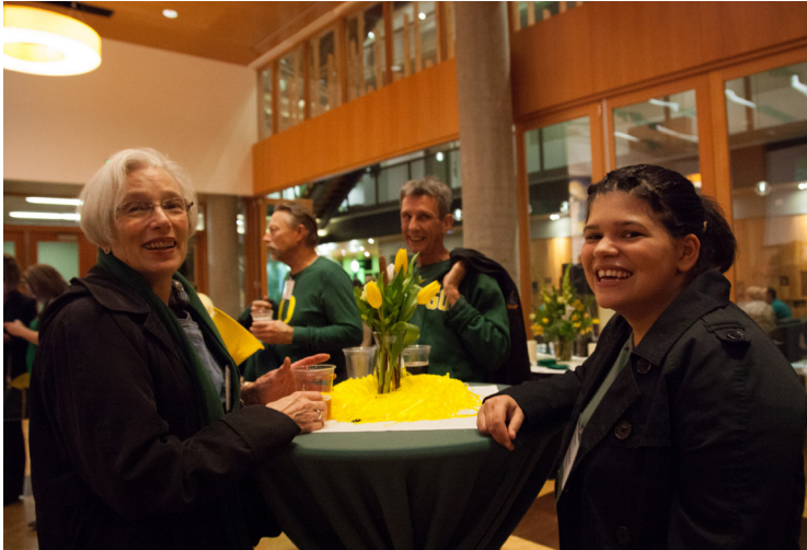
Do not use photos that have distracting backgrounds and excessive space between people