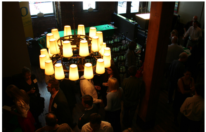
Do not use photos that are dimly lit.