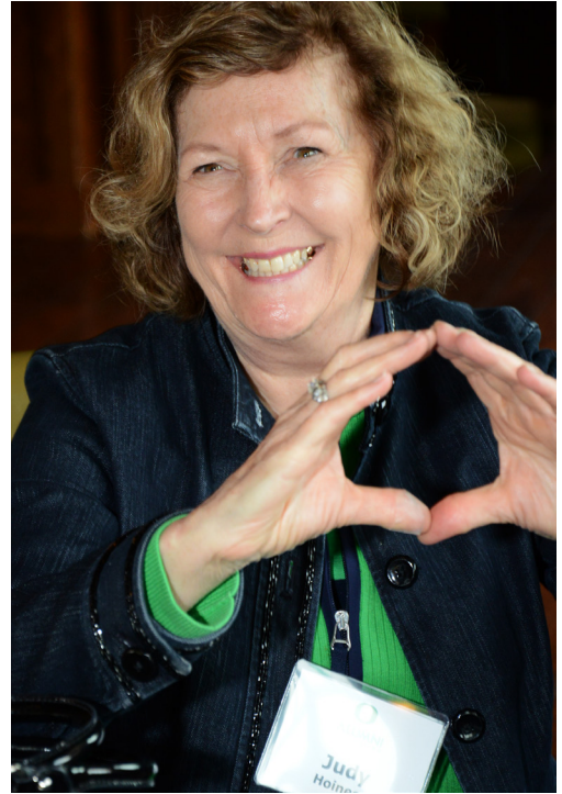
Do not use photos that have identifiable nametags.